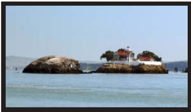
San Francisco Lighthouse by Klaus Ueberschaer Klaus took this picture with a Lumix FZ-50 from the Baylink ferry. He used a 'watercolor' filter to give the picture a different look.